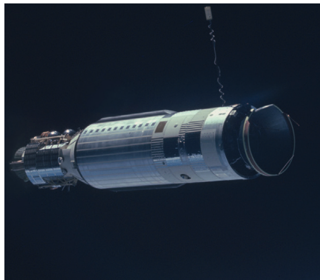
An Agena D booster stage photographed in orbit. One of these booster stages was the first successful satellite intercept scored by the U.S. at Kwajalein.

“Fortunately, intercept and destruction of an enemy satellite were never ordered,” the Bell Labs reports in the 1975 document. “After 1964, we were relieved of this ‘ready’ requirement and were once more able to concentrate on the normal R&D test program.”