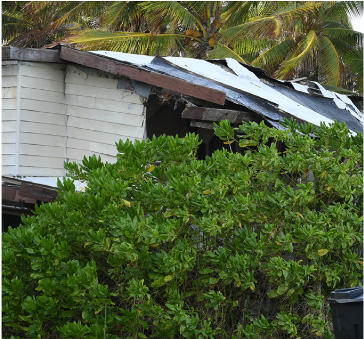
Homes in Kwajalein's Army Family Housing, located at the island's North Point, in late February 2023.

For questions regarding the refurbishment, please contact the USAG-KA Housing Office. Private messages regarding the refurbishment may be placed through the official USAG-KA Facebook page.