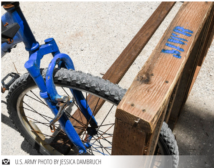
New BQ residents arriving after June 1 will pay to park at MWR's custom-built bike racks. The rule goes into affect June 1.

Assembly continues on the racks, which are being custom-built by MWR recreation specialists.