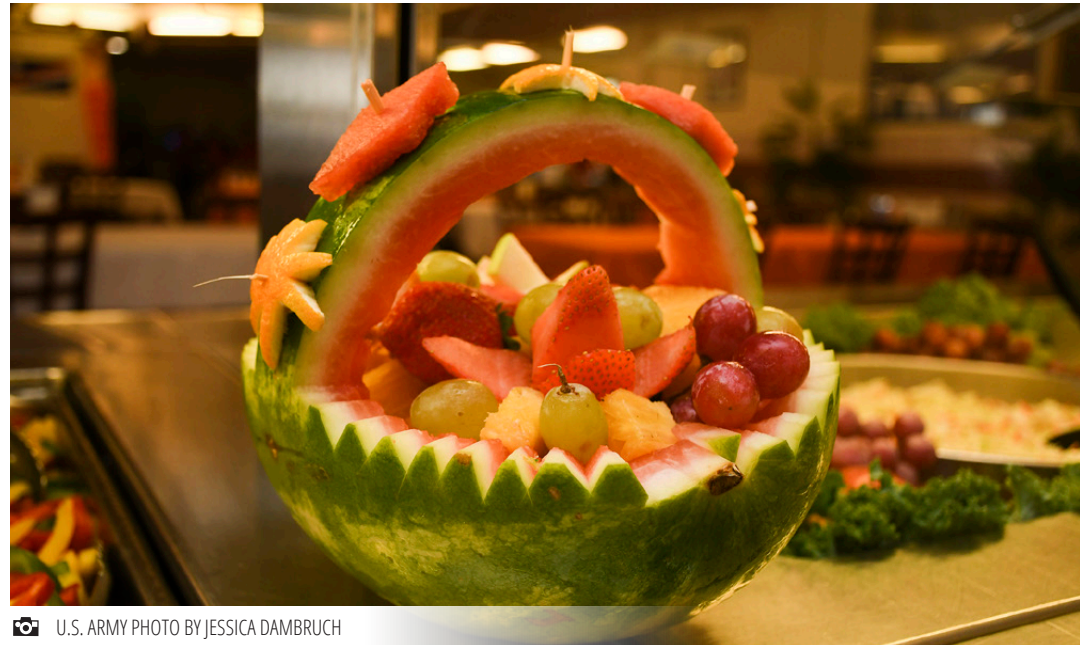
A Thanksgiving fruit basket featured at the Capt. Louis S. Zamperini Dining Facility in November 2022 may not be on the menu this year due to a change in RMI shipping and importation laws.

The change means myriad things for island life. Already, residents have reported placing more orders for "powdered greens" to blend