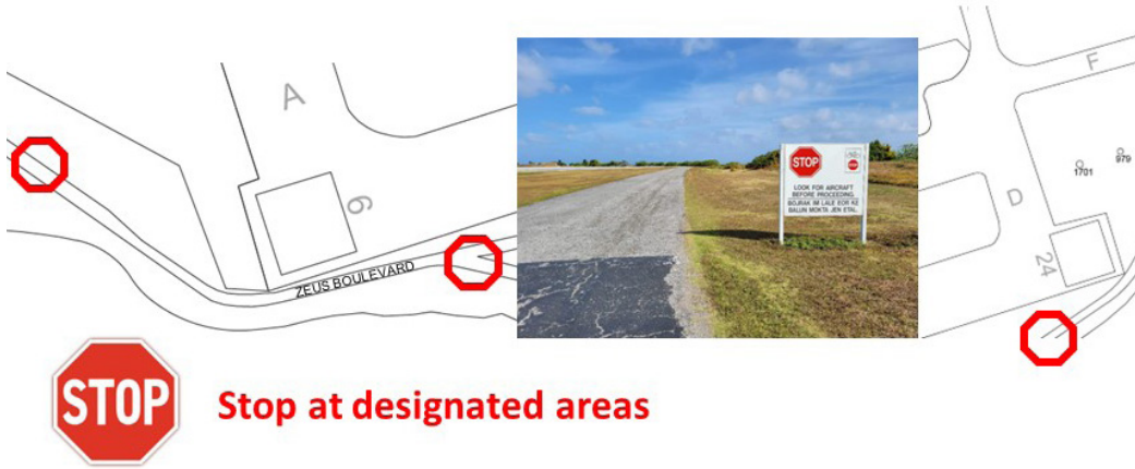
Stop at designated areas

TEMPORARY CLOSURE. The oceanside perimeter road will close to pedestrian, bicycle and vehicle traffic 20 minutes prior to heavy aircraft arrivals and departures. Contact Airfield Operations at 480-2131 with any questions.