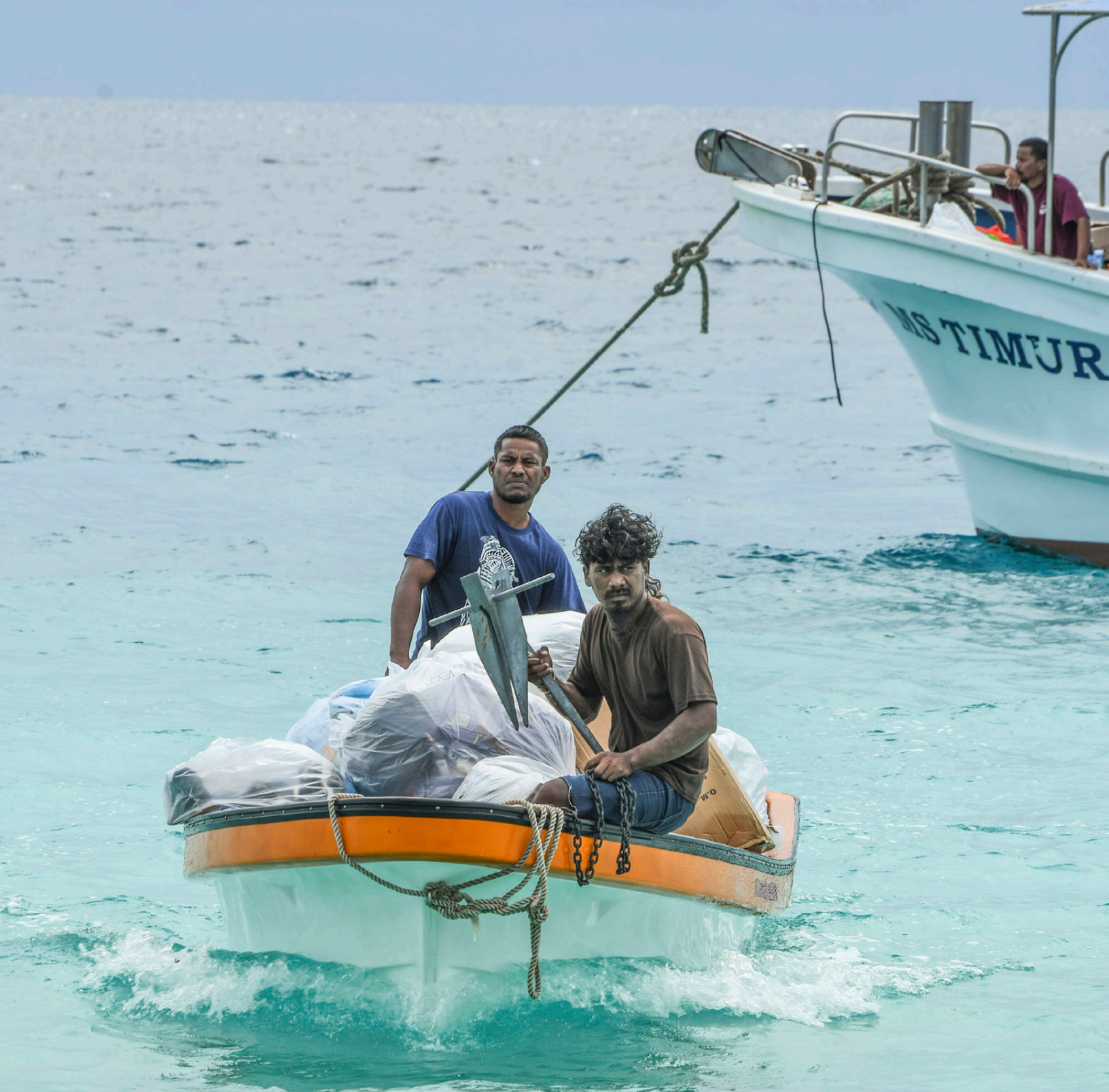
After loading their boat with cargo from the Marshall Islands Marine Resources Authority fishing vessel Timur, two residents of Namu Atoll make their way to shore for a gift-giving ceremony on Oct. 10. The Timur transported numerous Kwajalein visitors and hundreds of pounds of school supplies and housewares as part of a donation program with the RMI Liaison Office on U.S. Army Garrison-Kwajalein Atoll.