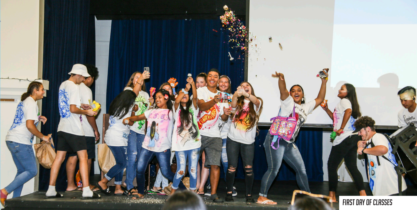
FIRST DAY OF CLASSES