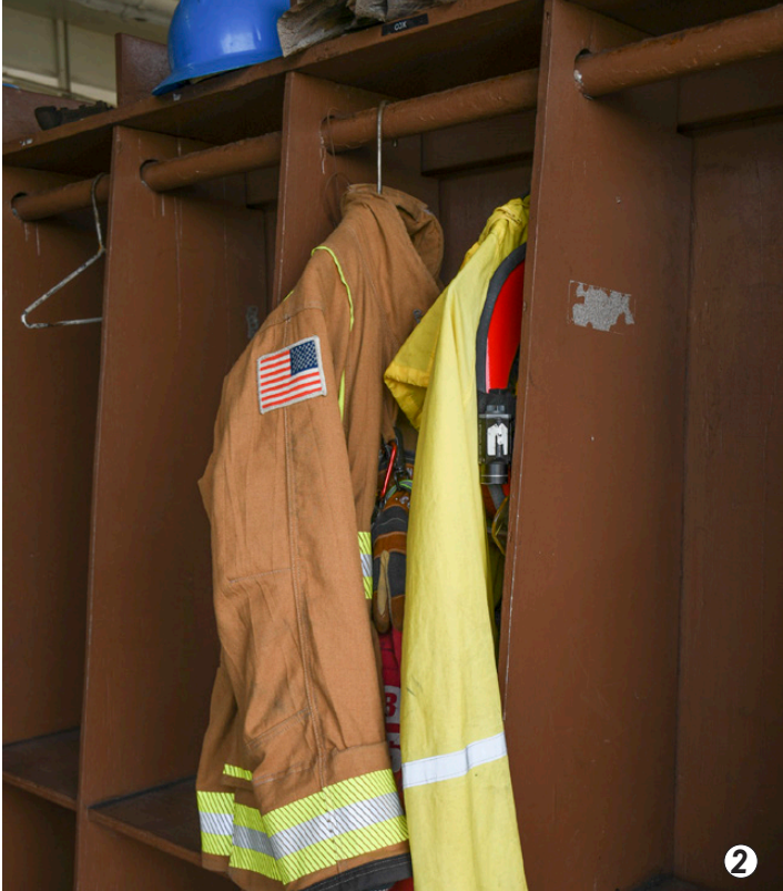
1) A familiar sight on the runway, a Kwajalein Fire Department fire and emergency crash rescue truck is stationed on Bucholz Army Airfield during routine flight operations in 2021. 2) Check out their gear and one can see that Kwajalein firefighters are prepared for just about anything. The KFD gear locker contains rows of uniforms, respirators and other protective firefighting equipment ready at a moment's notice.

It's just part of what we do," Baldrate said. "We are more than happy to assist."