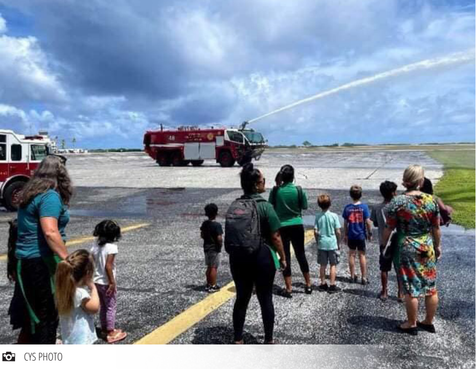
Child and Youth Services students enjoy a demonstration by the Kwajalein Fire Department during a fall field trip.