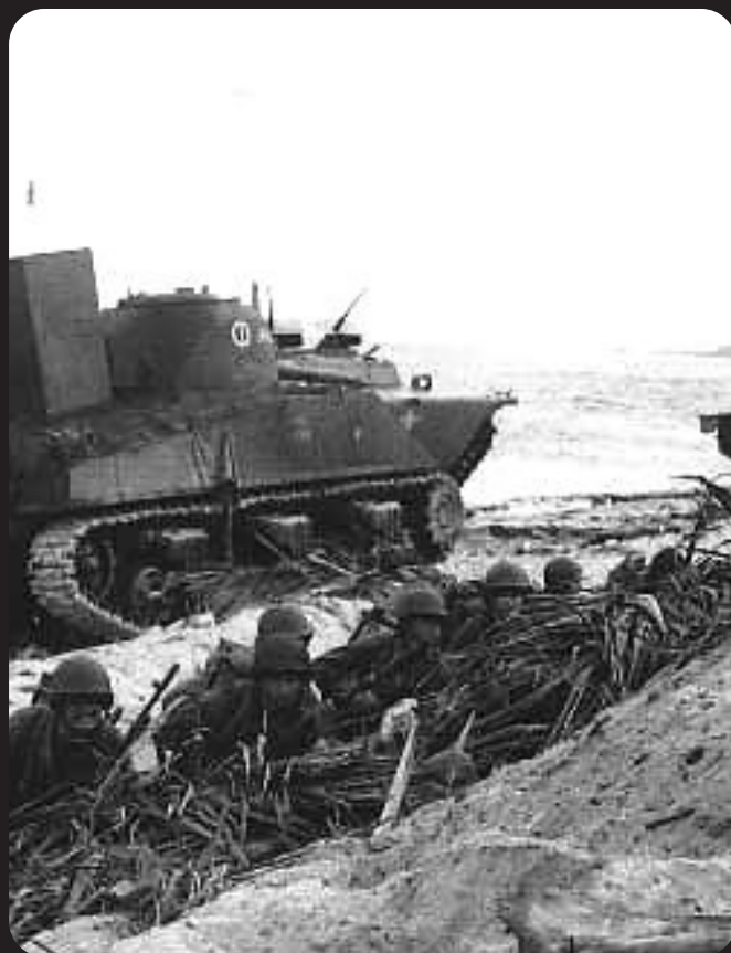
Above, the before and aftermath of battle during WWII, as Marines work to liberate Roi-Namur from enemy combatants.

Send announcements, community updates and event fliers to Kwajalein-hourglass@dyn-intl.com Wednesdays by 5 p.m.