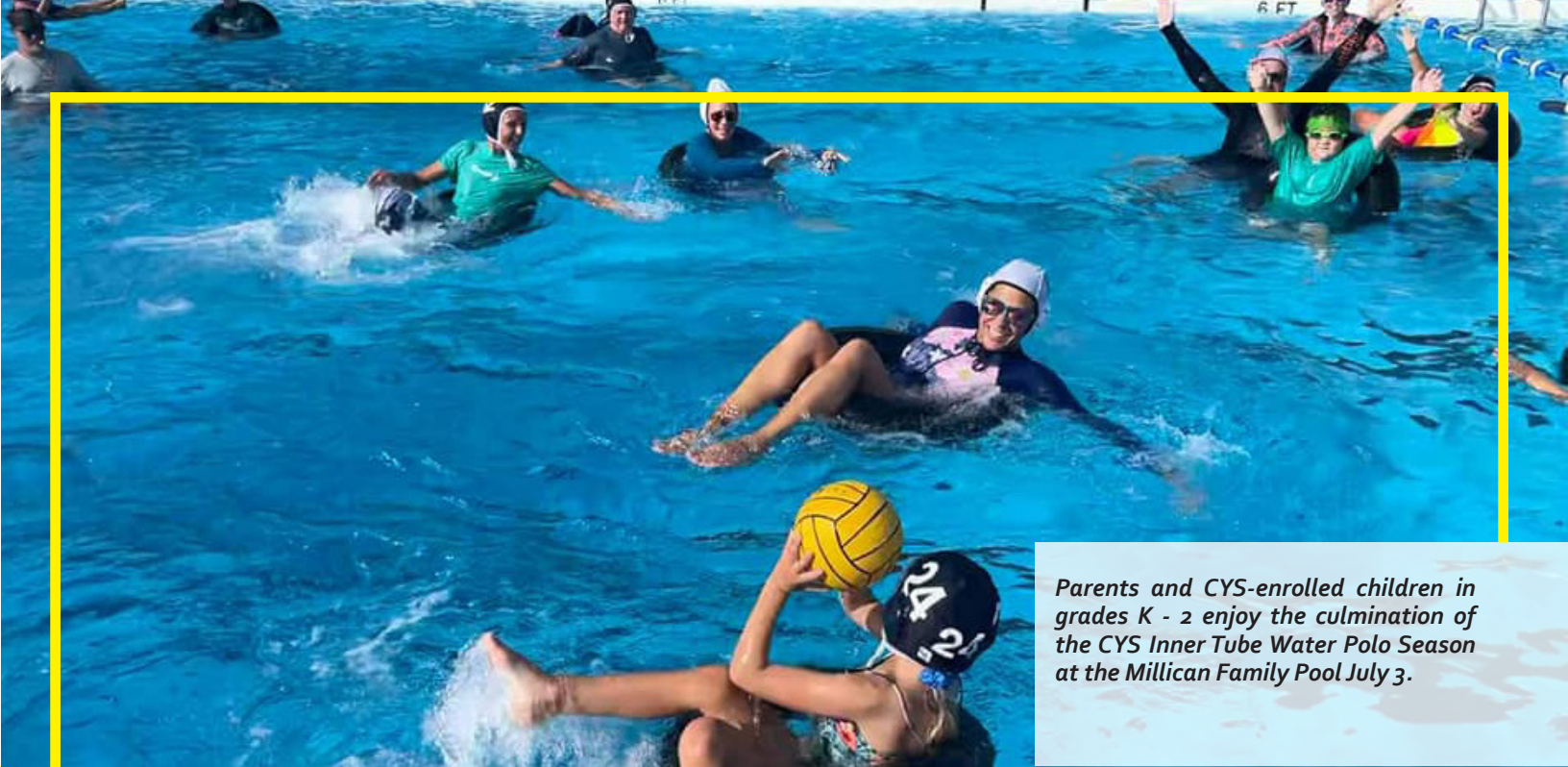
Parents and CYS-enrolled children in grades K - 2 enjoy the culmination of the CYS Inner Tube Water Polo Season at the Millican Family Pool July 3.