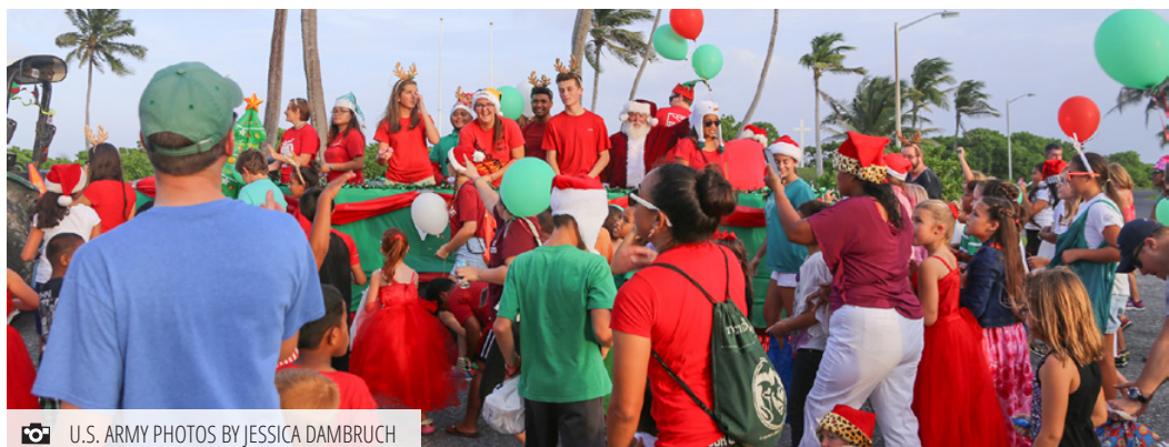
Join the Kwajalein community tonight for the annual Santa Parade and Tree Lighting Ceremony today. Call MWR at 5-3331 for details.