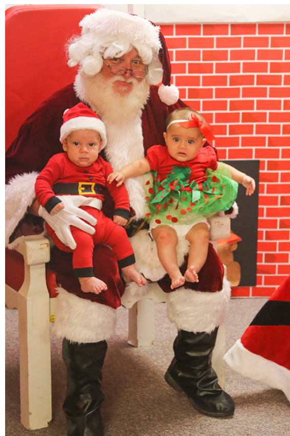
Bring a camera to Pictures with Santa Dec. 6 in the Grace Sherwood Library.

Candlelight Service. Dec. 24 at the Island Memorial Chapel. Join the Interdenominational Congregation at the Island Memorial Chapel for the annual Candlelight Service. It's the perfect beginning to Christmas evening. It is recommended that attendees arrive early: seats for this annual event fill quickly. More information for this event will be announced in the coming weeks. Check back for event times.