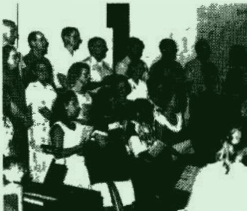
The Kwajalein Christmas Chorus takes a deep breath between selections.

Anyone wishing to record or photograph the work is invited to the rehearsal on Wednesday at 7:30 p.m. in the chapel.