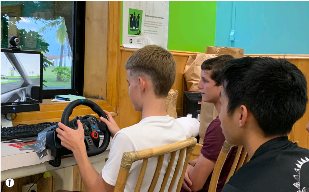
1) Teens train with the UPS Road Code program offered by USAG-KA Child and Youth Services. 2-3) In these photos, groups of teen graduates display their course completion certificates. They are well on their way to acquiring practical road safety skills behind the wheel of a golf cart.