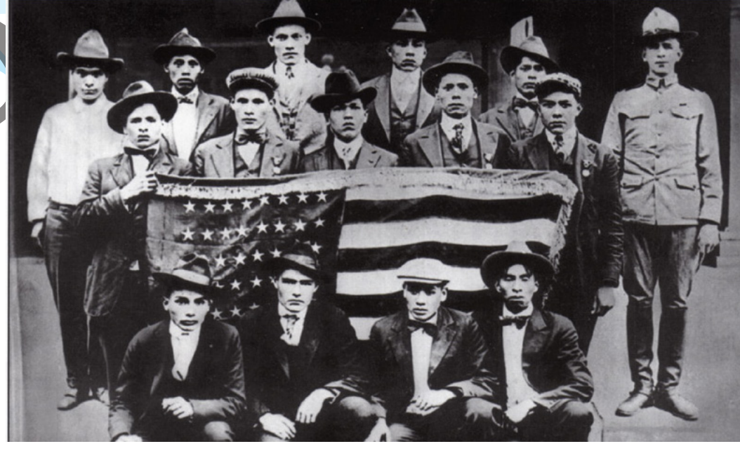
In this WWI-era, Choctaw Soldiers pause for a group photo during their training to make and receive coded radio and telephone transmissions.

During World War II, the Army used Indians in its signal communications operations in both the European and Pacific theaters of operations. Student code talkers were instructed in basic military communications techniques. The code talkers then developed their own words for military terms that never existed in their own native tongue. For instance, the word for