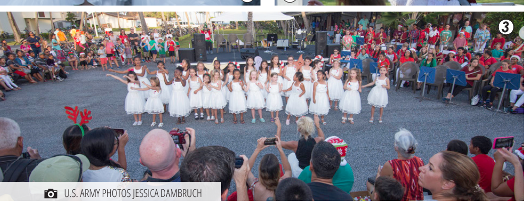
1) Dancers perform at the 2018 Tree Lighting Ceremony. 2) Santa waves to the crowd during the holiday parade. 3) Spectators enjoy live performances at the 2018 Tree Lighting Ceremony.

Watch Santa arrive at DeMeo Athletic Field at 5:15 p.m. Sunday, Dec. 7, and join the holiday parade to welcome him to Kwajalein.