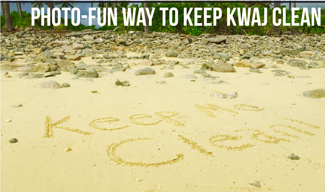
PHOTO-FUN WAY TO KEEP KWAJ CLEAN

National Clean-Up Day is the third Saturday in September, but on Kwajalein, we can celebrate anytime we want.