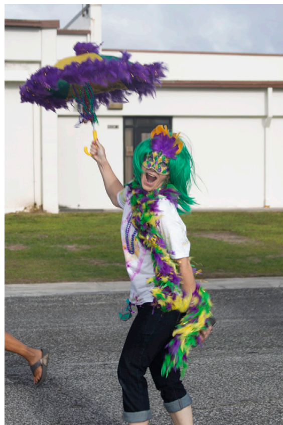
A costumed parade walker marches in the Mardi Gras parade.