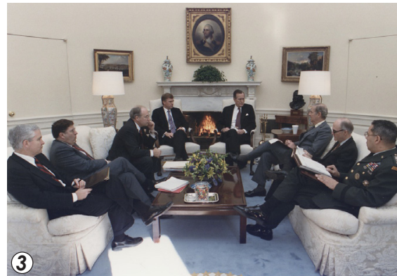
1) George H.W. Bush seated in a Grumman TBA Avenger on the USS San Jacinto circa 1944. 2) Bush meets with Former President Dwight D. Eisenhower. 3) Bush meets with Robert Gates, General Colin Powell, Secretary Dick Cheney and others about the situation in the Persian Gulf and Operation Desert Shield, Jan. 15, 1991.