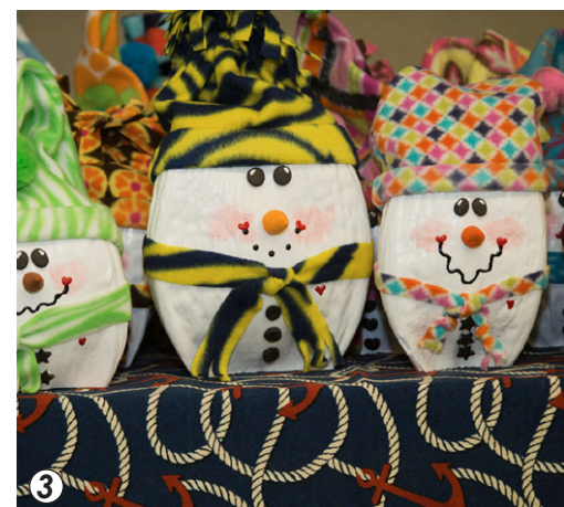
1) Shoppers at the Kwajalein Art Guild Holiday Bazaar check out vendor tables Nov. 12 in the MP Room. 2-3) Painted pottery and coconuts transformed into snowmen were among items available for sale.