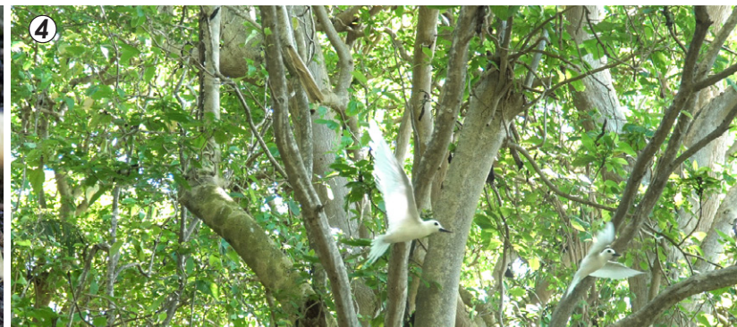
1) The view of the shoreline and surf at Eniwetok. 2) USAG-KA's Patriot vessel is moored just off the conservation area beach. 3) This small crab seeks shelter in the roots of a pandanus tree. 4) White fairy terns float in the breeze.