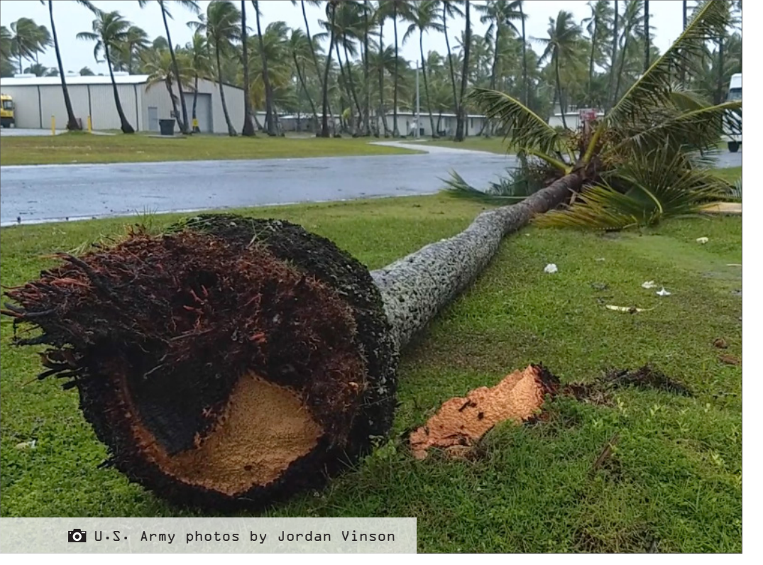
A palm tree uprooted by strong winds Aug. 25 lies near Lagoon Road on U.S. Army Garrison-Kwajalein Atoll.