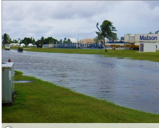
(4) 🗖 Courtesy of Mark Brunson

1-3) Heavy rainfall and winds clocked at 47 miles per hour whip across Kwajalein the morning of Aug. 25. 4) The rains abate to reveal flooded roads. Lagoon Road is no longer visible in this picture taken near the Kwajalein Power Plant.