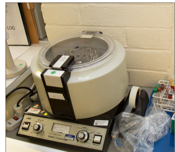
A centrifuge in the Kwajalein Vet Clinic Lab.

Check out the Vet Tech Tips on page five for how to care for your pet and fight heat exhaustion on Kwajalein.