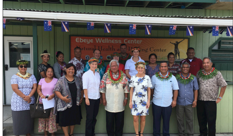
②