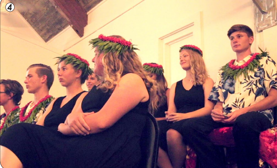
Saturday, June 2, 2018 / Volume 59 Number 22