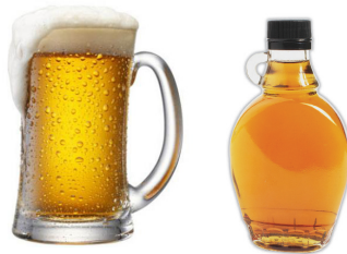
Alcohol and liquids in general