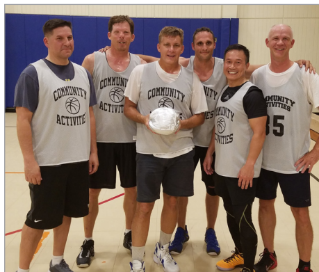
B LEAGUE CHAMPIONS Island Bawlers