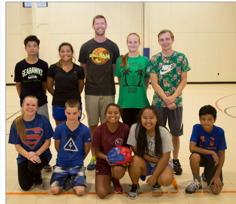
SCHOOL LEAGUE CHAMPIONS Space Jam