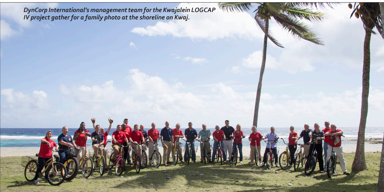
DynCorp International's management team for the Kwajalein LOGCAP IV project gather for a family photo at the shoreline on Kwaj.