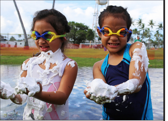
Kwaj Shaving Cream Social Saturday, Oct. 21 The Richardson Ravine

4:30-4:40 p.m. Pre-School (Must be accompanied by adult in the pit) 4:40-5 p.m. K – 2nd Grade 5:10-5:30 p.m. 3rd – 6th Grade 5:40-6 p.m. Jr. and Sr. High