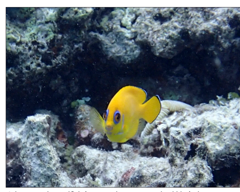
A lemonpeel angelfish is spotted among coral rubble in lagoon waters near North Point on Kwajalein.

Captured in the image above is a lemonpeel angelfish (Centropyge flavissima), a common reef fish found throughout the Marshall Islands and the greater Pacific Ocean.