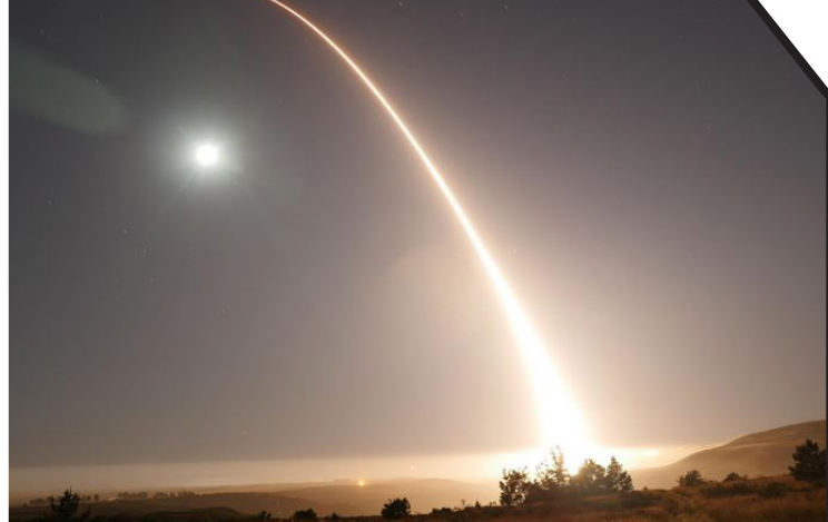
An unarmed Minuteman III intercontinental ballistic missile launches during an operational test at Vandenberg Air Force Base, May 3.