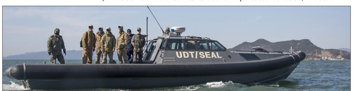
U.S. and South Korean explosives ordnance disposal units work together off the coast of Jinhae, South Korea, as part of exercise Foal Eagle, March 3. The North Korean launches early March 6 are thought to have taken place in response to the annual exercise.