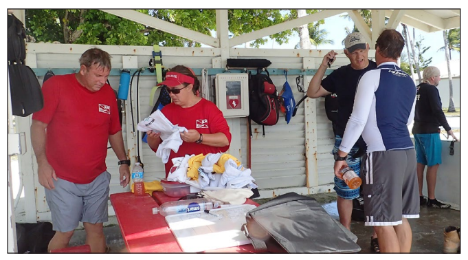
LEFT: High School Basketball champions, Monstars, defeated And One, 34-33, taking the title. RIGHT: Kwajalein Scuba Club volunteers man the recent KSC Scuba Shack during the club's underwater poker run at Emon Beach.