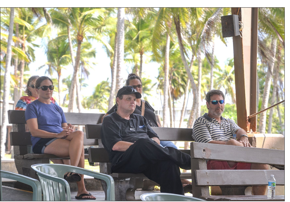
Residents of Roi-Namur listen while neighbors field questions to USAG-KA Command staff and KRS leadership during the latest town hall meeting on the islet.