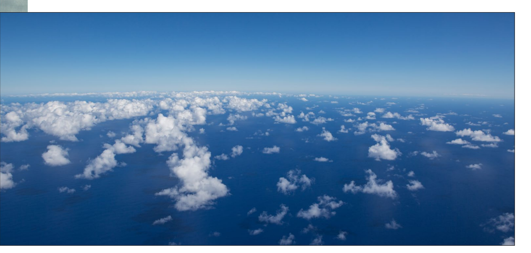
The view from 10,000 feet up is as serene as it is blue. Temperatures inside the fuselage at this altitude can get into the 50s.

"How high can you take these helicopters," I say into my headset as we turn back southeast. 14,000 feet, Kilgore replies—about three times the cruising altitude of the Metro flights most USAG-KA residents are used to.