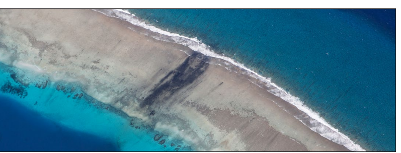
The remains of the Japanese RO-60 submarine lies on the east reef about 17 miles south of Roi-Namur.

Circling back south, we leave the Takamushikan Reef and fly onward, passing Gagan, Meck, Gugeegue, the causeway islands