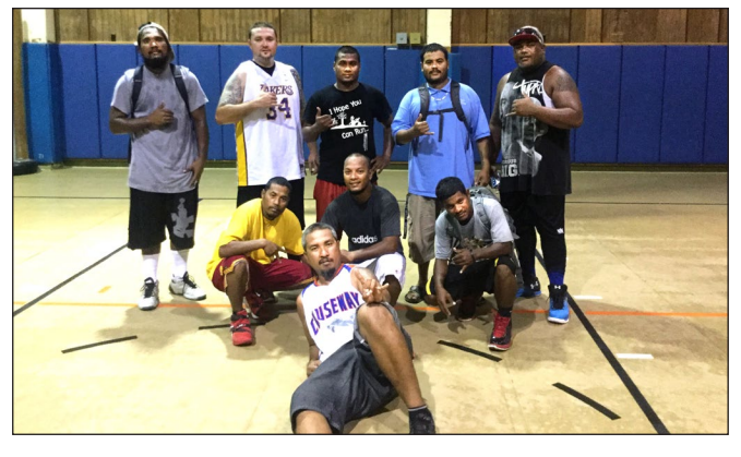
LEFT: A League basketball champions, Faith, celebrate their win against Spartans I, 52-48, in the A League championship playoff games at the CRC, Feb. 28. RIGHT: B League Champions, Savages, defeated Vikings, 57-41, in the B League championship playoff games at the CRC, March 7.