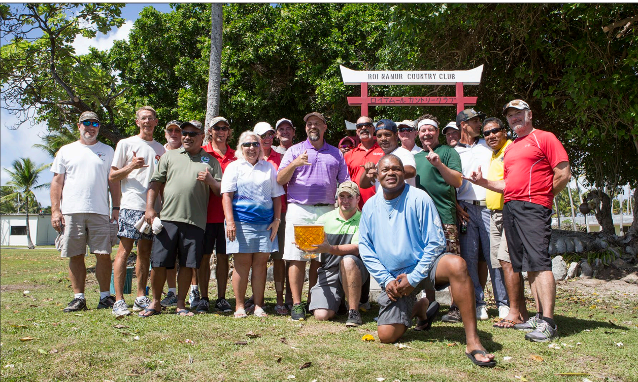
Team Roi-Namur celebrates with the beloved Atoll Cup after securing a 7.5-to-6.5 victory Sunday, Feb. 19, against Kwajalein during the 2017 Atoll Cup Golf Tournament at the Roi-Namur Golf Course.

The results of the tournament follow on page five.