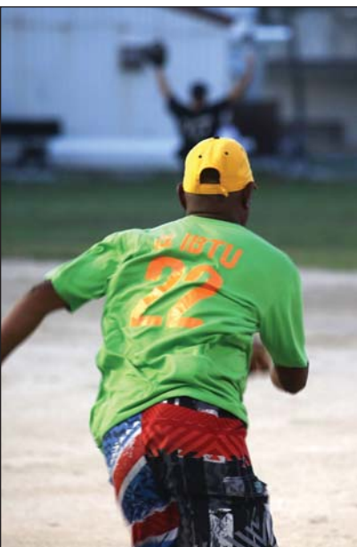
Zoom zoom. Kwajalein's Number 22 slugger bounds from first base toward second in the finale against Old, Fat and Lazy.