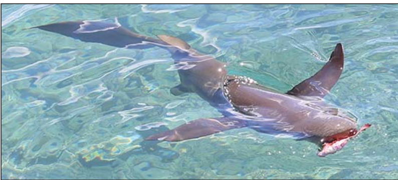
A nurse chomps down on a red snapper thrown into the water at the marina to draw in the sharks.

While the series will cover everything from culture and geology to history and biology, a major emphasis will be sharks.