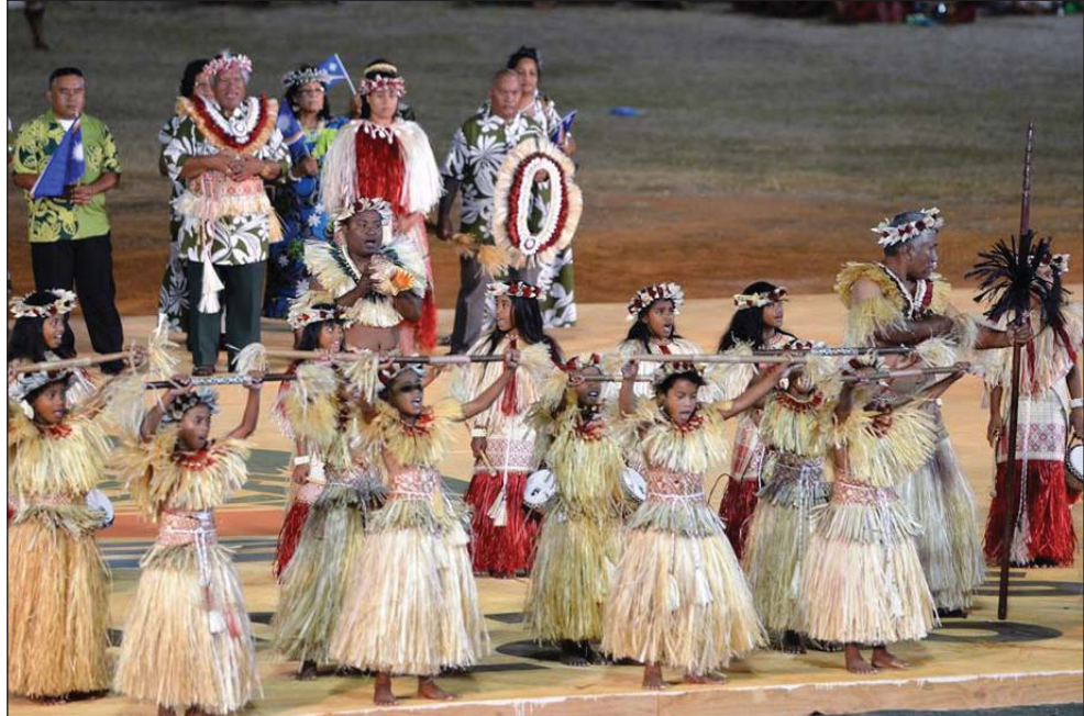
Kwajalein Atoll residents and Ujae clans and descendants perform the Jobwa Stick Dance during the opening ceremony of the 2016 Festival of Pacific Arts in Guam.

The festival, which lasts about three weeks this year, features delegations, performers and vendors from 27 Pacific island nations in a menagerie of cultural and artistic exhibits. Held every four years, it began in 1972 through an effort by the Secretariat of the Pacific Community to curtail the erosion of traditional customs in the region.