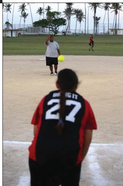
Lollygaggers' pitcher warms up his canon before the May 26 championship game at Brandon Field on Kwaj.