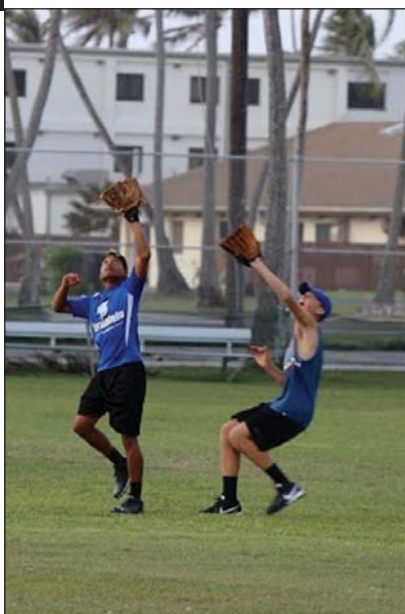
Spartan Men's outfielder zero in on a high fly ball shot into the outfield May 25.