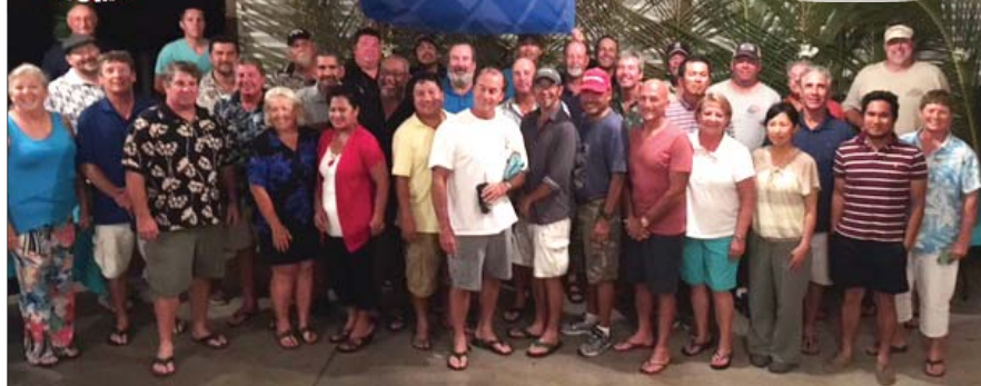
The 2016 Coral Open Golf Tournament players gather together May 14 during the tournament dinner at the Vets Hall.