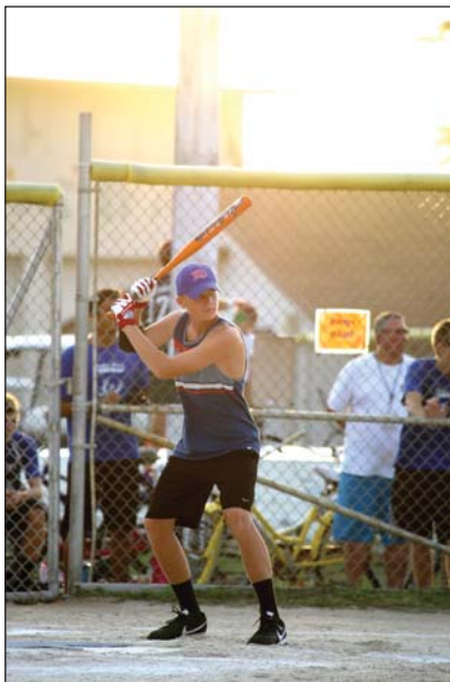
A Spartan Men's batter takes to the plate against 993-Cartel during the 2016 Kwajalein B League Softball Championship at Brandon Field.