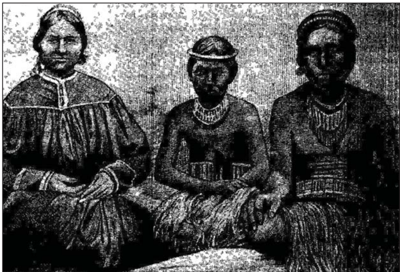
A nahnken of Ponape, left, with wife and child

During 1856, there were 3,463 deaths due to Smallpox on the island of Guam – almost half of its population.