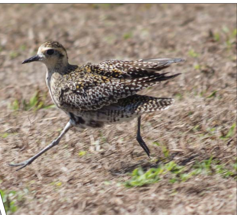
LEFT: An adult Pacific golden plover sports its breeding plumage while pecking around for food on Kwajalein April 13. RIGHT: A juvenile sprints from the photographer April 13. Unlike adults, juveniles do not feature breeding plumage that is as bold and eye-catching as adults.