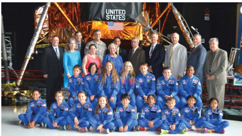
2015 ASDMA scholarship class.

Once selected by ASDMA, winners will be required to provide an attendance application, including a camp physical, to the U.S. Space and Rocket Center. Scholarship application forms are available on their website at www.asmda.us .