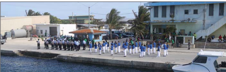
USAG-KA Command staff, Kwajalein Jr./Sr. High School Band members and State Department officials join RMI and KALGOV police officers in a parade into Ebeye's town center to start the atoll's Memorial Day celebration Feb. 9.