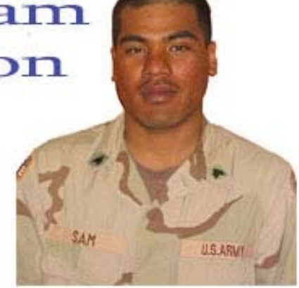
March 4, 1982 - Dec. 4, 2008

Dec. 4, 2015 at 10 a.m. Echo Pier, Kwajalein