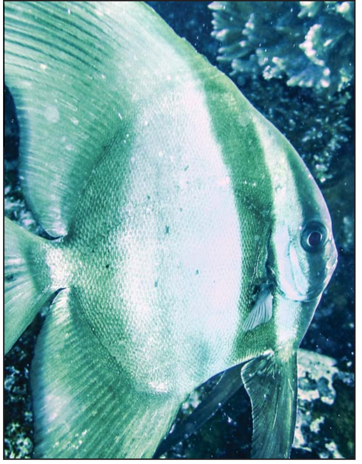
Orbicular batfish

The health of the species, in terms of population size, has not yet been evaluated by the International Union for the Conservation of Nature.