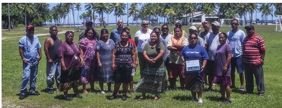
Kwajalein Range Services employees who reached an impressive 10-year employment record on the garrison are honored by community leaders July 25.