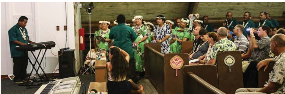
The New Generation Choir of Calvary Chapel on Ebeye sing a couple of songs for the baccalaureate ceremony at the Island Memorial Chapel.