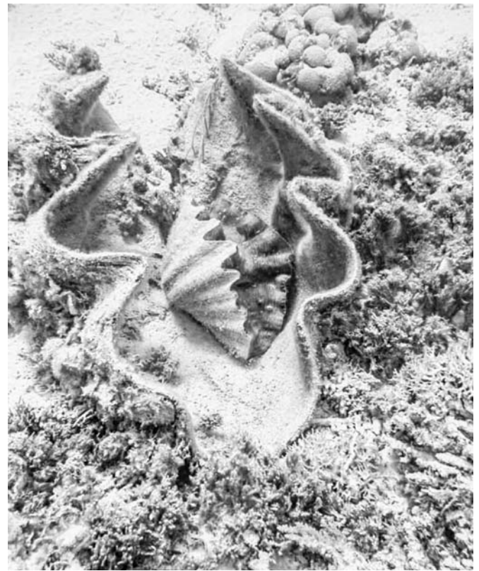
Photo of a giant clam

The giant clam is the largest bivalve mollusk on the planet, growing 450 pounds in weight and nearly four feet in length and reaching over 100 years in age, if permitted. Unfortunately, few giant clams ever reach their full potential due to impacts from human harvesting for food and for the aquarium trade. While the International Union for the Conservation of Nature has placed the species firmly on its vulnerable list, giant clam flesh remains a delicacy in France, East Asia and many Pacific island nations. The species is native to waters off south-east Asia and throughout the western Pacific.