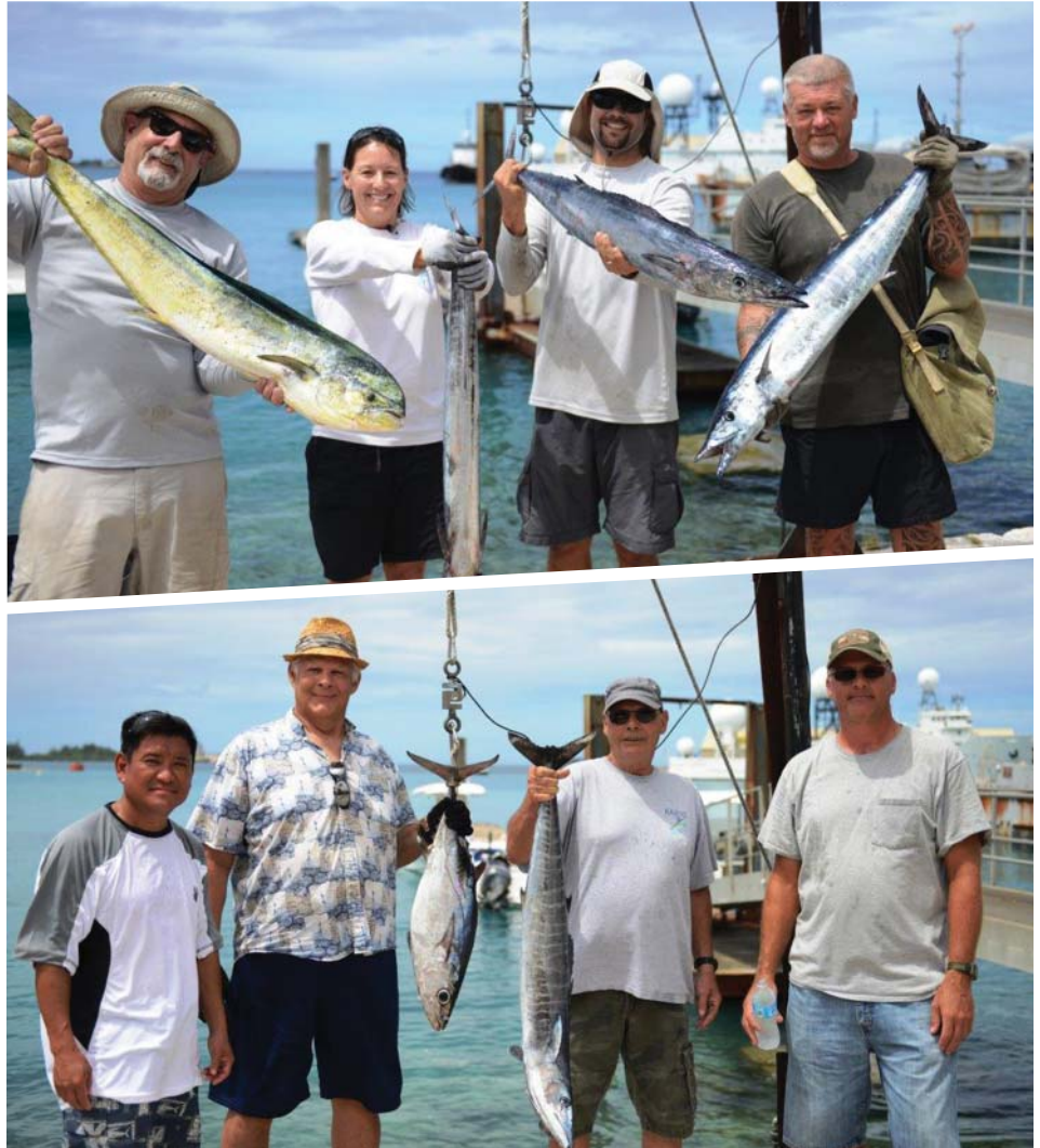
TOP: Team Ice Pirates celebrates its winning catch at the KAISC Wahoo-Mahi Derby Feb. 16. BOTTOM: Team Going For Broke pauses for a photo after getting back to the Small Boat Marina. The team split the $1,100 prize for the wahoo category with Team Ice Pirates.

KAISC thanks everyone who participated in the derby.