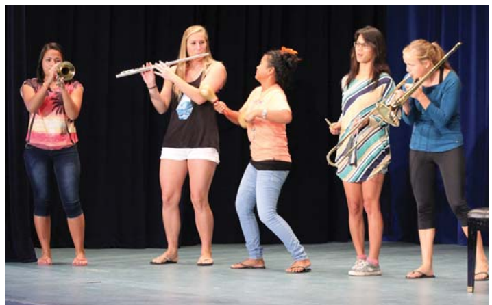
Senior girls play instruments in the "Kwajalein's Got Talent" skit at the Variety Show hosted by the Keystone Club Sunday at the MP Room.

Clubs of America and is Kwajalein's main leadership focused club outside of school. Youth from grades 9-12 plan, execute and evaluate various community focused events each year. This year's group has 28 active members who are required to attend monthly lunch meetings at the Teen Center.