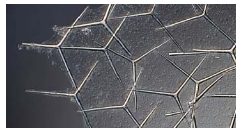
Sponge spicules under a microscope. Spicules are to blame for itchiness in Kwajalein pools.

As a reminder, both pools are salt-water flow-through pools