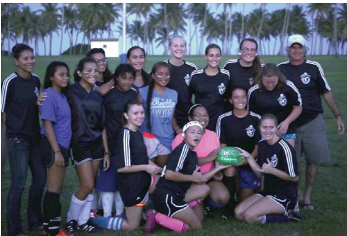
The Kwajalein women's Spartans soccer team celebrates their victory against KAT during the 2014 Women's Soccer Championship.