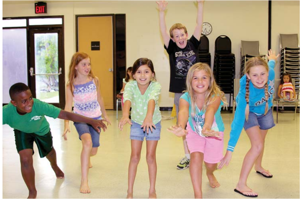
Members of the Kwajalein Children’s Theater practice at CRC Room 1 Oct. 25 for their upcoming production of “The Wizard of Oz.”

Out of the 17 kids, only about half have performed in a play before. They practiced every Saturday as a group, but also got together