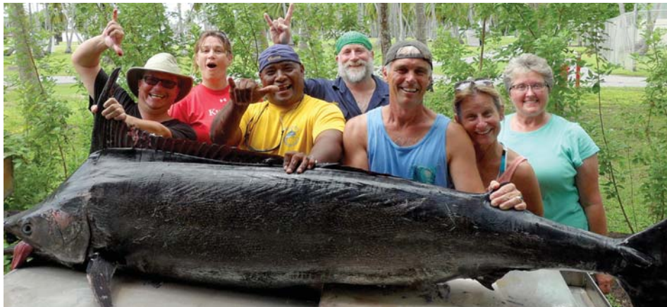
From Donald Engen