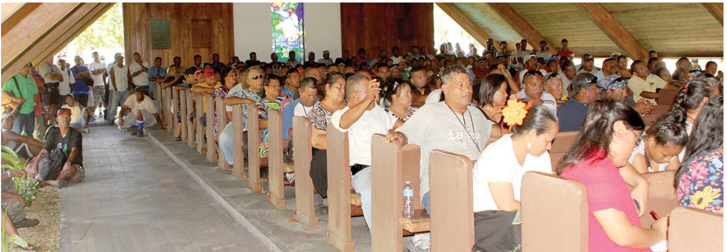
A crowd of over 300 Marshallese employees congregate at Island Memorial Chapel June 21 for a town hall meeting with RMI President Christopher Loeak.