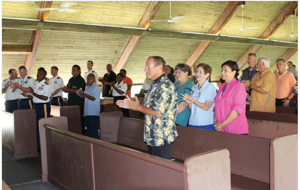
USAG-KA Soldiers, DoA civilians, contractors and their families stand for recognition at the 239th U.S. Army Birthday celebration June 14 at Island Memorial Chapel.

The audience stood while the national anthems of the United States and the Republic of the Marshall Islands played. They remained