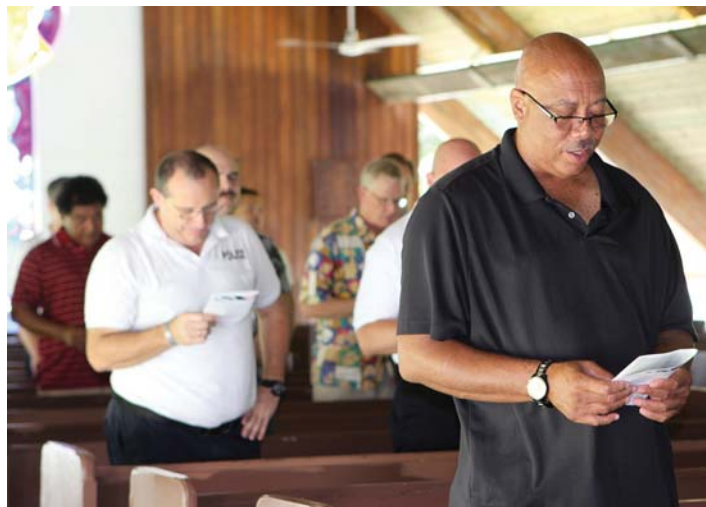
Audience members sing the Army Song at the closing of the 239th U.S. Army Birthday celebration June 14.