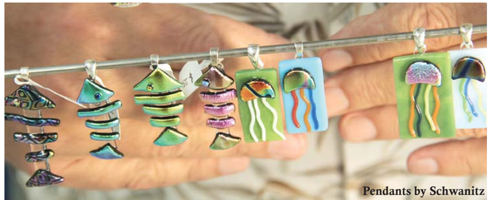
Pendants by Schwanitz