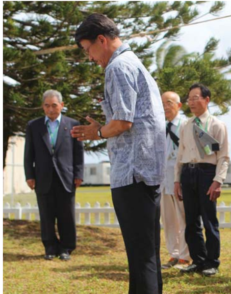
The Japanese ambassador to the Marshall Islands pays his respects.

On Kwajalein, they planted a young utilomar tree between two tall, thin pine trees. The tree will serve as a lasting, and living, memorial to the visitors' fathers,