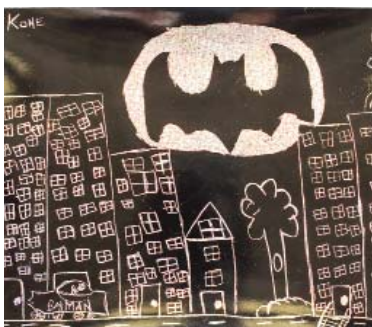
Third-grader Kone Tagoilagi's "It's the Bat Signal" submission.