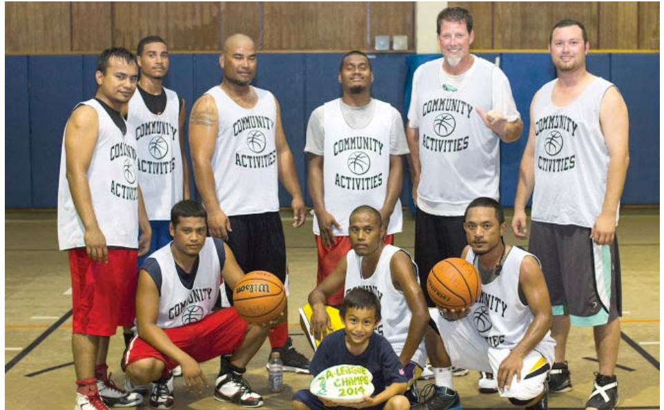
Icy Hot, the 2014 Men's A-League basketball champions, enjoy their win against Remix following the championship game March 14.

Between the fifth and 11th minute in the second half, Remix honed their jump-shots, gained offensive rebounds, hit much-needed 3-point shots and got lucky on a number of occasions when Icy Hot missed several field goals. What resulted was a 16-point scoring streak by Remix, which Icy Hot answered not even once. During six full minutes