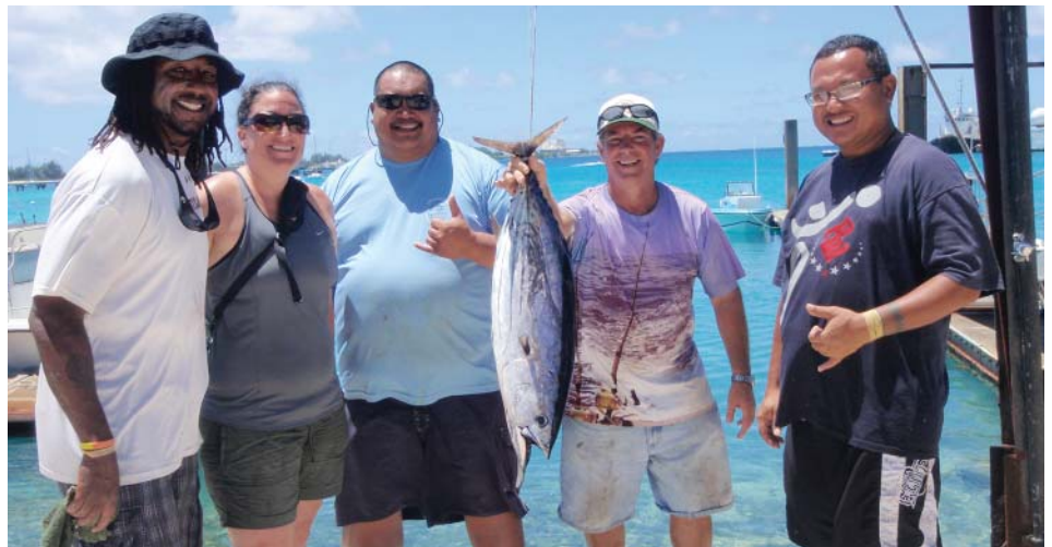
The group with their 21.5-pound aku tuna.