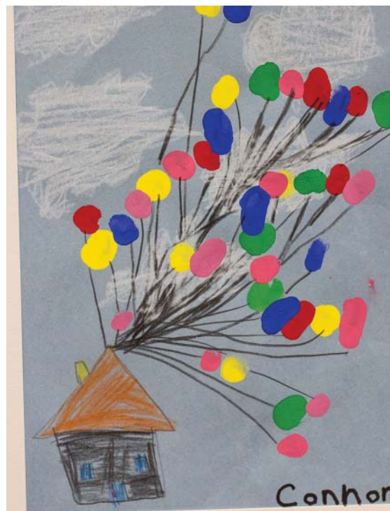
First-grader Connor McDiffett's rendition of the flying house from the Pixar-Disney movie "UP."