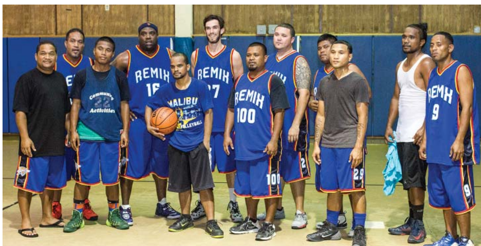
Remix pause for a team photo after battling Icy Hot March 14.

Approaching the end of the season with a single loss, there seemed to be little doubt as to whom the trophy would be awarded. Expectations of a rematch with team Auto—the only team able to beat