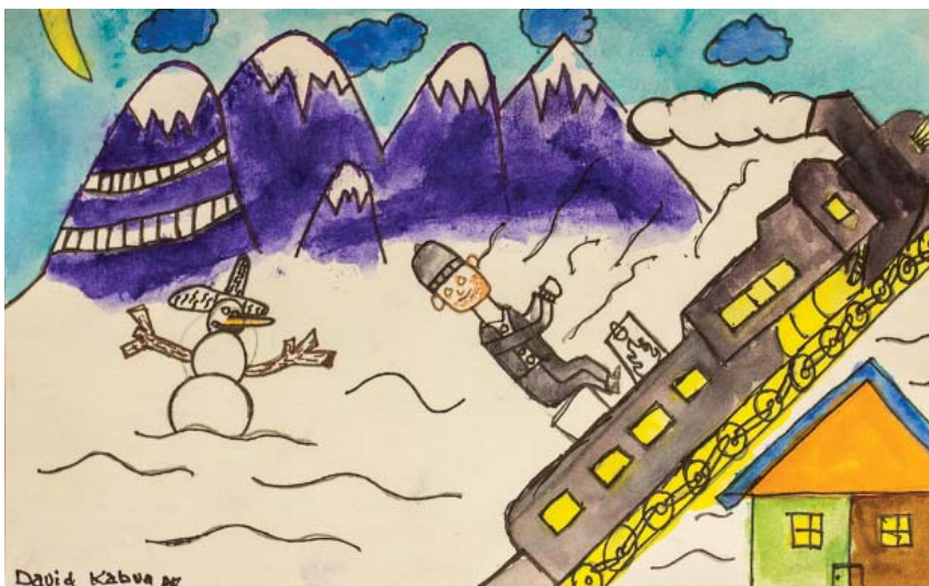
Sixth-grader David Kabua's landscape rendition of a scene from "Polar Express."