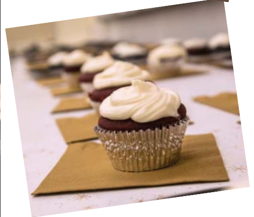
Desserts such as beignets, top, and red velvet cupcakes, bottom, were available to accompany coffee drinks at the French Quarters Café.