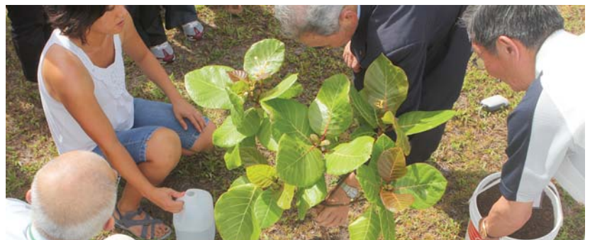
The group plants an utilomar tree at the cemetery to serve as a remembrance for the Japanese soldiers lost during Operation Flintlock.