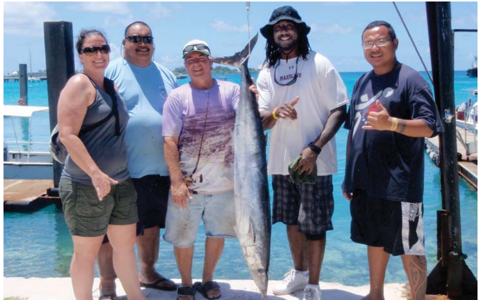
Captain & Crew with the 35.5-pound ono the team caught March 9.

If you are up for the challenge, there are still three categories of fish left to be caught: mahi-mahi, ahi and marlin. The challenge is open to all Kwajalein anglers and will be ongoing until each category of fish is caught. It only costs $25 to enter, and it takes place every Sunday at the Small Boat Marina. See you on Sunday if you are up for the challenge.