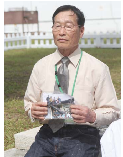
A visitor holds up an old family photo of loved ones who perished in WWII.

The front of the memorial stone on Kwajalein depicts squares that represent each prefecture in Japan. Each