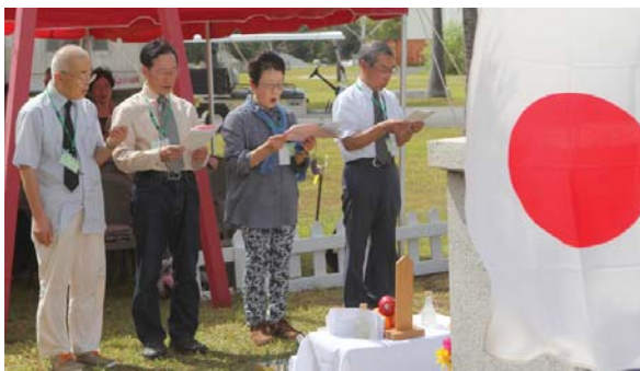
Hymns are sung to honor the war dead at the end of the ceremony.

square is made from minerals specific to each region. The back of the stone reads, "In memory of those gallant men who fought and died for their country at the Marshall and Gilbert Islands during the second World War. May they lie in peace."