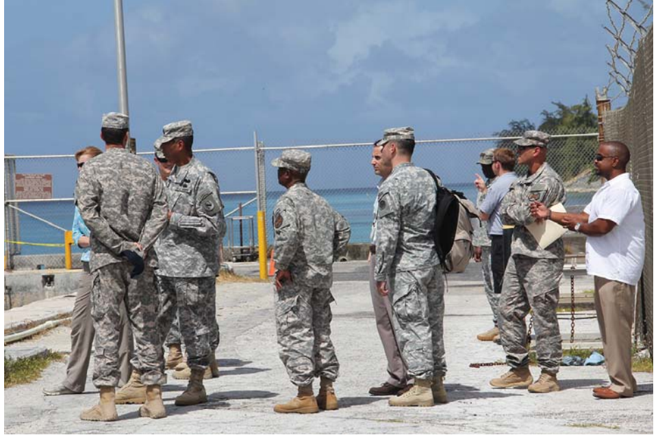
Gen. Vincent Brooks' official party takes a look around the Kwajalein pier and marine facilities.

At the Command building off Ocean Road, the general received