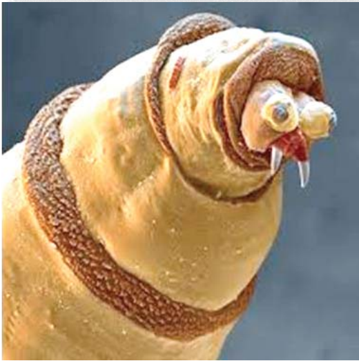
A fly maggot viewed through an electron microscope

On Nov. 2, 2013, the Kwajalein Atoll Pest Management Department did an inspection of food waste disposal habits of unaccompanied and accompanied residents on Kwajalein. The results of the study revealed that serious problems persist with the ways in which individuals and families dispose of their scraps.